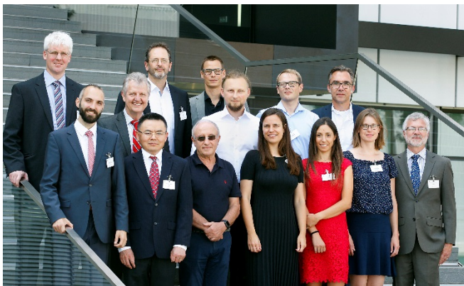
Image 2: The finalists of the Berthold Leibinger Innovationspreis 2018 at the jury session on July 13 in Ditzingen.